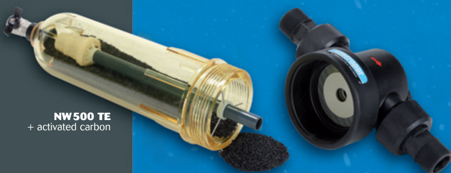
NW500 TE + activated carbon

The activated carbon CINTROPUR is sold separately and is highly suitable for the improvement of taste and the removal of odour, chlorine, ozone, micropollutants such as pesticides and other dissolved organic substances.